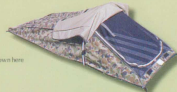
Camo shown here